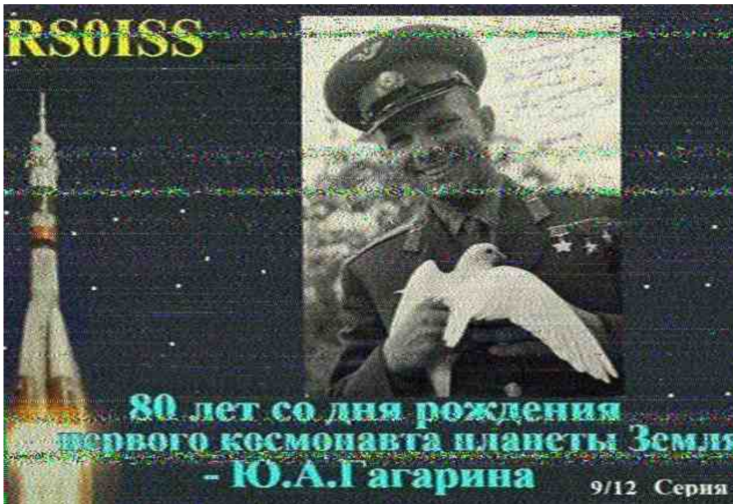
Picture of Yuri Gagarin holding a dove